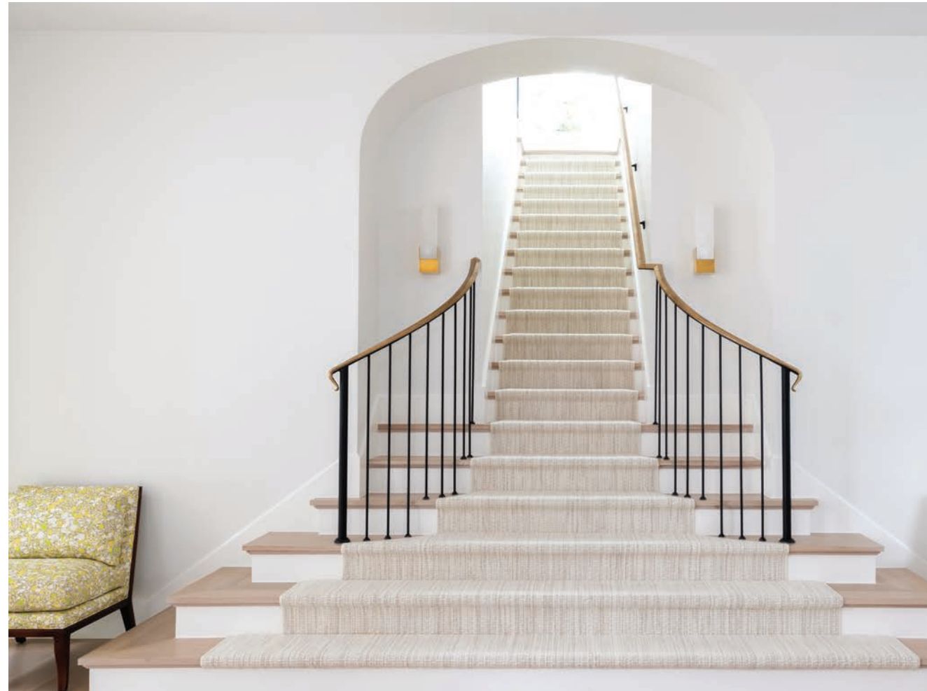
Clockwise from top left: The staircase makes for a grand entry into the great room; this custom Lucite bench has us green with envy; this dream closet boasts wallpaper from Christian Lacroix; the guest room features a cheerful yellow fabric from Caryn Cramer. Opposite page: This jewel box of a room includes drapes from Lulie Wallace fabric and pops of purple from Jerry Pair Leather.